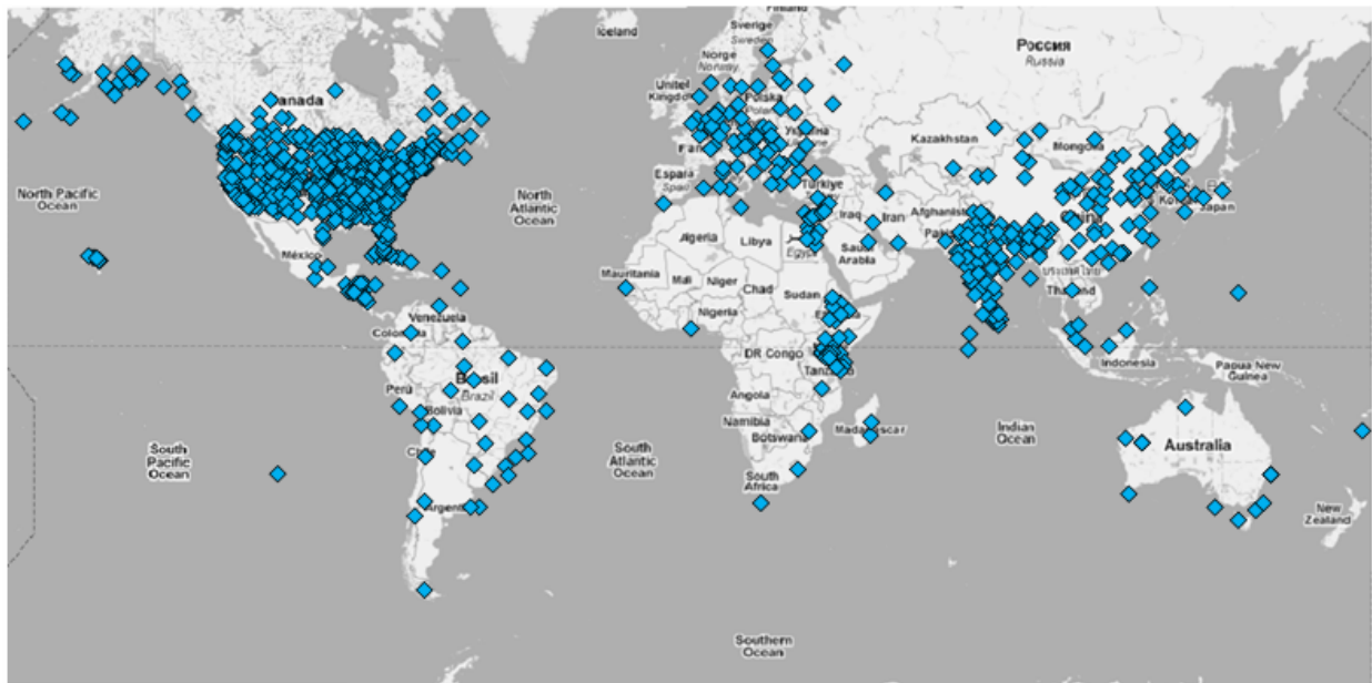
Figure 1. Meteorological data collected from 875 different sites located around the world